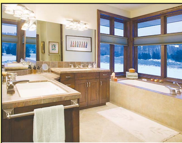
There's a world of possibility in every home. You may not realize how luxurious your bathroom could really be.

Ford Construction is located at 150 Industrial Court in Kalispell, open 8 a.m. to 5 p.m. Monday through Friday. For more information please call 755-5224 or visit www.fordconstructioncorp.com