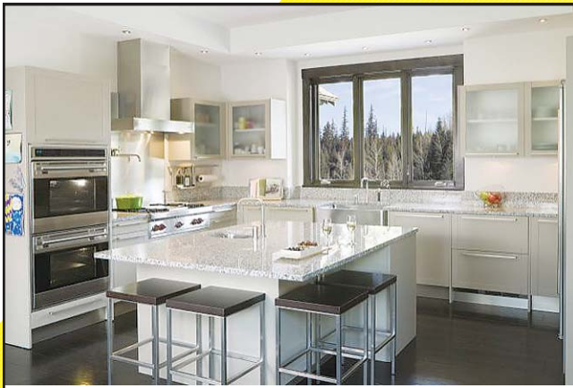
Kitchens are one of the most common rooms to update and remodel.